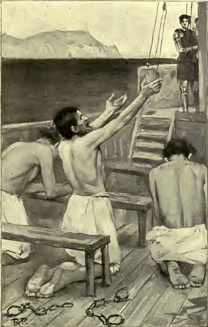
THE THREE KNIGHTS OF THE CROSS GIVE THANKS FOR THEIR RELEASE.